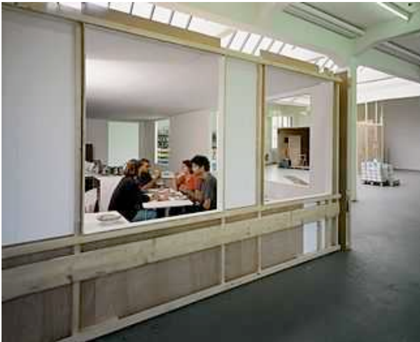
Rirkrit Tiravanija. Untitled (Free) , 1992- (1992)

In his exhibition 'Das soziale Kapital', Rirkrit Tiravanija is directly concerned with the function, history and image of the wholesale Swiss distributor Migros. As well as mementoes of Migros' past, such as the historic 'shop-on-wheels' or the poster with the legendary stone which Migros' founder, Gottlieb Duttweiler, hurled through a window of the parliament building, a variety of items from the wholesale distributor's product range stand side by side with works from the collection. For this one occasion Thomas Schütte's puppets can be found in the clothing department. Shopping trip and museum visit as one single experience. The migros museum is set to become a unique emporium for goods and ideas.