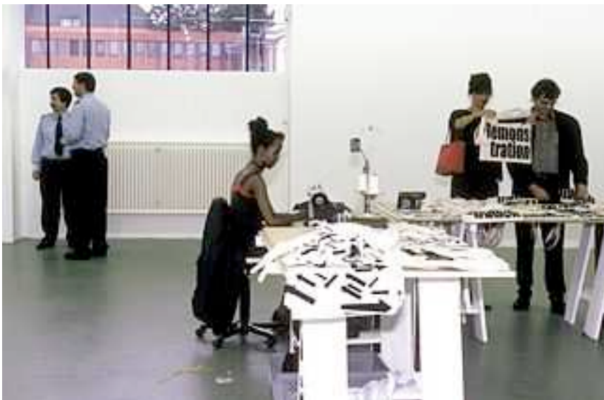
Rirkrit Tiravanija. Needlework Shop (1998). 'Das soziale Kapital', needlework shop, 1998