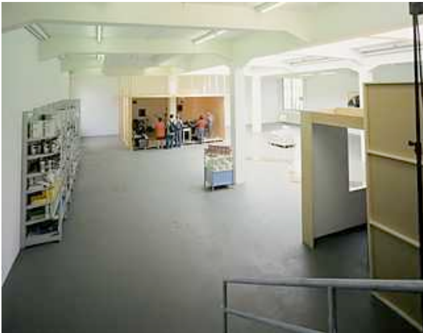
Rirkrit Tiravanija. Untitled (Music Rehearsal Studio) , 1996- (1996)