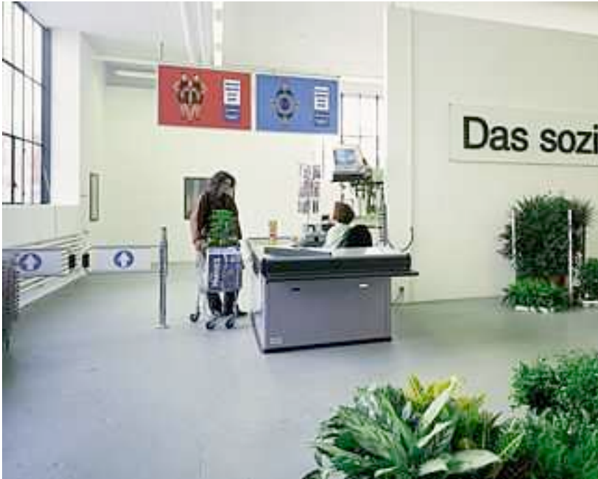
Rirkrit Tiravanija. Supermarket 2 (1998) 'Das soziale Kapital', Supermarket, 1998