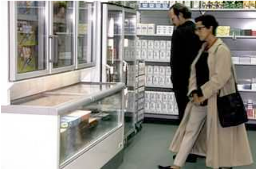
Rirkrit Tiravanija. Supermarket 3 (1998) 'Das soziale Kapital', Supermarket, 1998