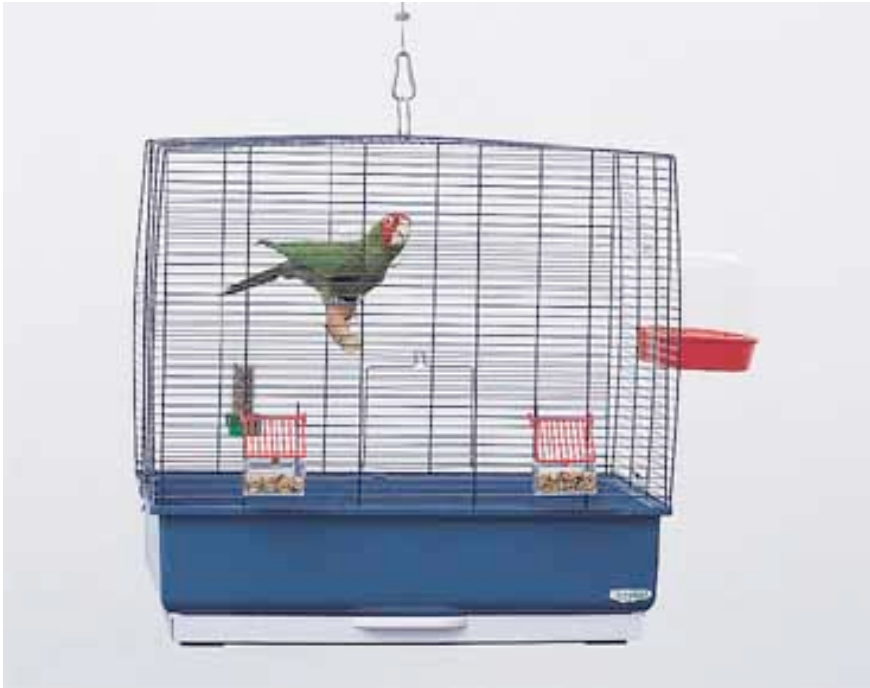
Rirkrit Tiravanija. Untitled (parrot) (2000). Mixed media .