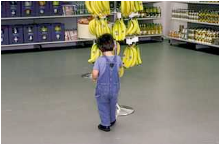
Rirkrit Tiravanija. Supermarket 1 (1998) 'Das soziale Kapital', Supermarket, 1998