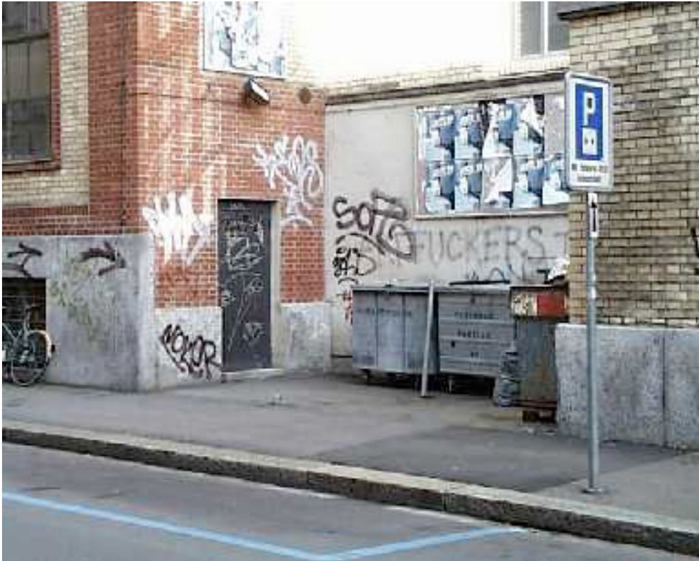
Rirkrit Tiravanija. LISTE 99 (1999)