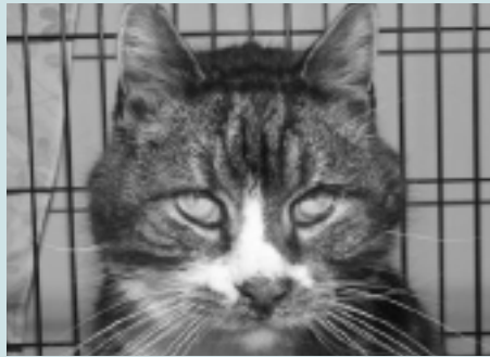
12-year-old Pugsley is a very sweet, quiet and loving guy. He gets along with the other cats and with older children.