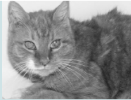
Elsa is a lovely 13-year-old female. She would probably like being an only kitty.