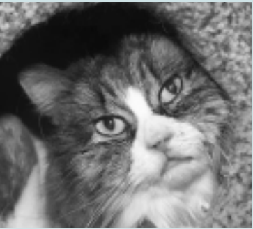
Zoe is a 9-year-old DLH tiger/coon female. She is looking for a quiet home with no small children.