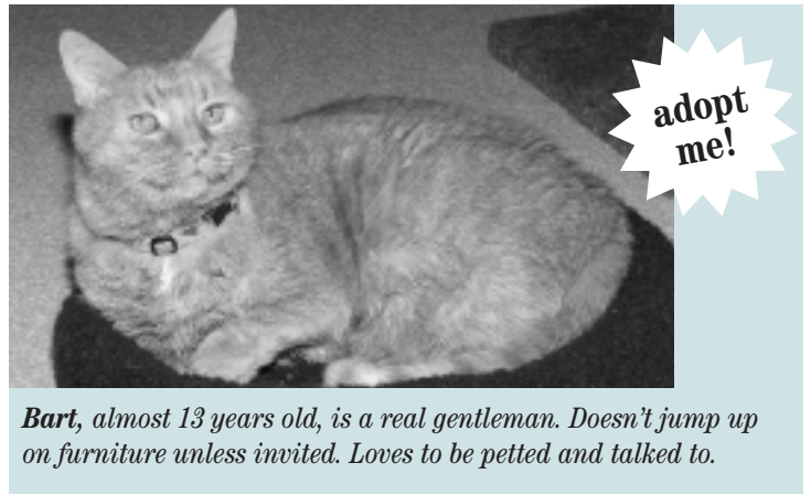
Bart, almost 13 years old, is a real gentleman. Doesn't jump up on furniture unless invited. Loves to be petted and talked to.