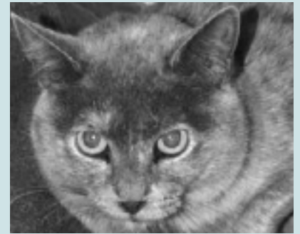
Teeny Weeny is a shy 3-year-old female. She is FIV+ and would do very well as a buddy cat to another kitty with FIV.