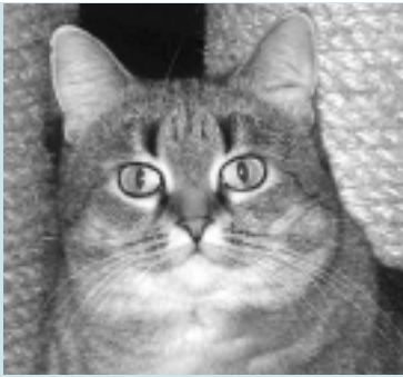
Mama is a 6-year-old DSH tiger. She is very sweet and needs a quiet, patient home.