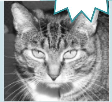
Terri— DSH grey tiger w/white SF, 1 yr. She is quite sweet, but does not like other cats.