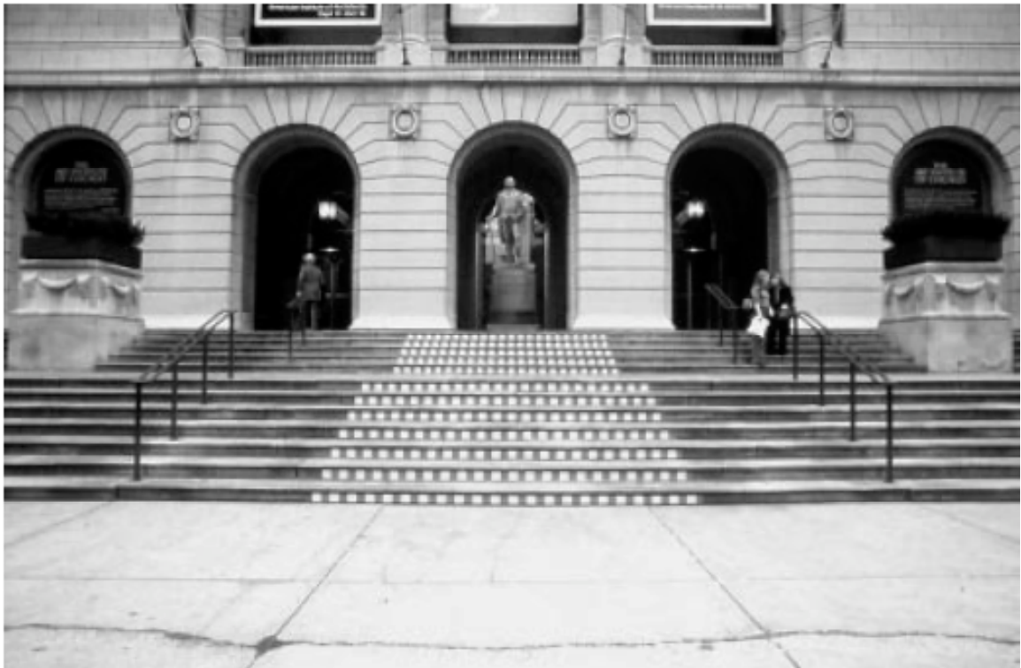
DANIEL BUREN, photo-souvenir: UP AND DOWN, IN AND OUT, STEP BY STEP, travail in situ (extérieur), Art Institute of Chicago, 1977, detail. (COPYRIGHT: DANIEL BUREN)