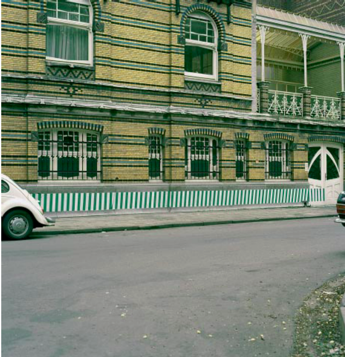
DANIEL BUREN, photo-souvenir: (SANS TITRE), travail in situ (extérieur), Wide White Space Gallery, Anvers, Janvier 1969, detail. (COPYRIGHT: DANIEL BUREN)