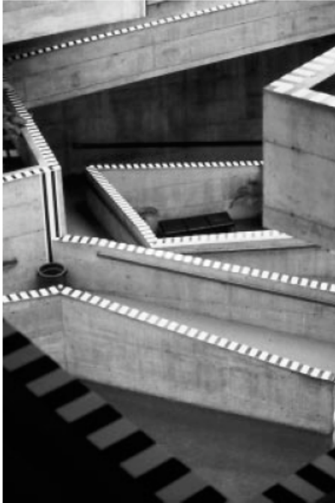
DANIEL BUREN, photo-souvenir: STALACTIC/STALAGMITIC: A DRAWING IN SITU AND THREE DIMENSIONS , travail in situ, University Art Museum, Berkeley, California, 1979, detail. (COPYRIGHT: DANIEL BUREN) 67

paper—cut parallel with its printed stripes and defined by the width of the wall section—from the top to the bottom of all wall surfaces. By means of these ribbon-like bands, he demarcated the juncture of the walls’ many intersecting axes. The vertically-cut stripes broke up the severity of the harsh, concrete space, while the repetition of the stripes as rectangles along the tops of all the parapets diagrammatically analyzed the nature of the fractured space and visually tied it together. The Berkeley installation thereby transformed the architectural barriers of the museum into unifying, rather than divisive, structures. As in his Mönchengladbach exhibition, Buren incorporated the walls of the exhibition space within the work instead of treating walls as passive backdrops or neutral elements of enclosure.