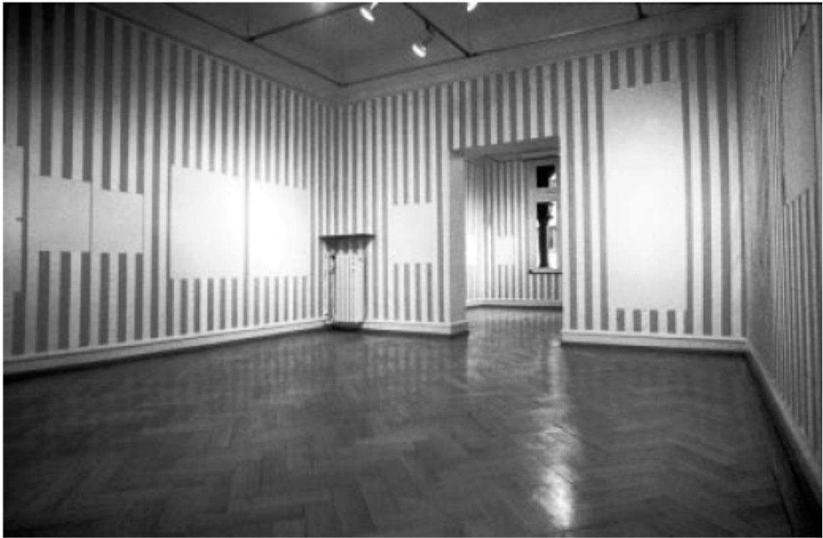
DANIEL BUREN, photo-souvenir: À PARTIR DE LÀ..., travail in situ, Städtisches Museum, Mönchengladbach, November 1975, detail, see/siehe CABANE NO. 0, 1975–1982, p./S. 68.