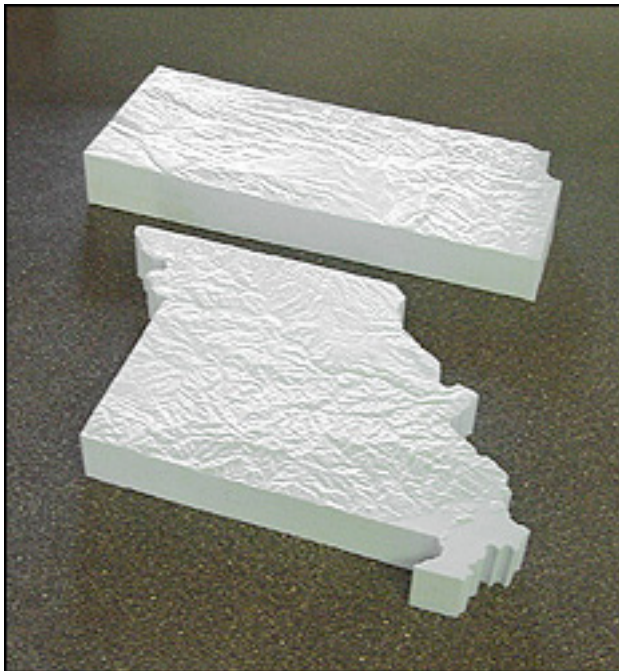
Allan McCollum. Topographical models of Kansas and Missouri . Kansas: 4 x 11 x 27 inches; Missouri: 3 x 23 x 17 inches. 2003. Cast Hydrostone, white alkyd primer.

souri, offering to donate them as “blanks,” to be painted or otherwise embellished by their staffs in whatever ways suited their particular program needs. Over 120 museums accepted the gifts. The artist delivered the 120 models himself, during the summer of 2003, in a rented van.