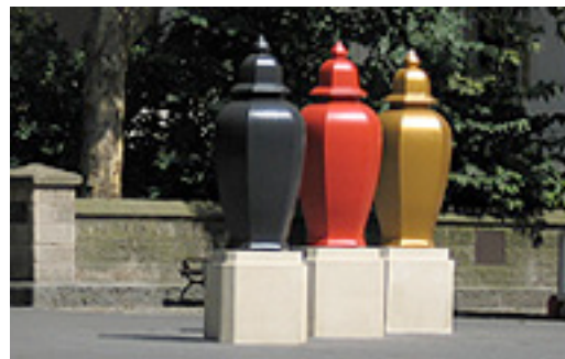
Allan McCollum. Perfect Vehicles , 1988/2004. Acrylic latex on concrete.