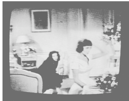
"Paintings on location—incidental to the action," black-and-white photograph, 11 by 14 inches.

In fact, serial production does not recognize the fine art/mass culture distinction (and is partially responsible for its dissolution). So that when McCollum exhibits his own series of black-and-white photographs of interiors, themselves taken from TV series, he moves us out of the gallery and into mass culture, demonstrating the pervasiveness of serial production. In McCollum's photographs of everyday life as