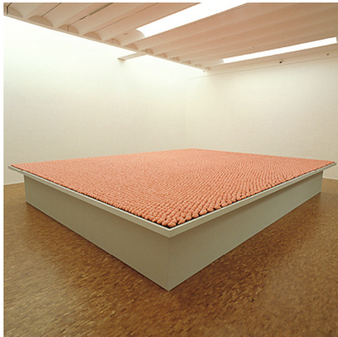
Allan McCollum. Over Ten Thousand Individual Works . 1987/89. Enamel on cast Hydrocal, 2" diameter each, lengths variable; each unique.