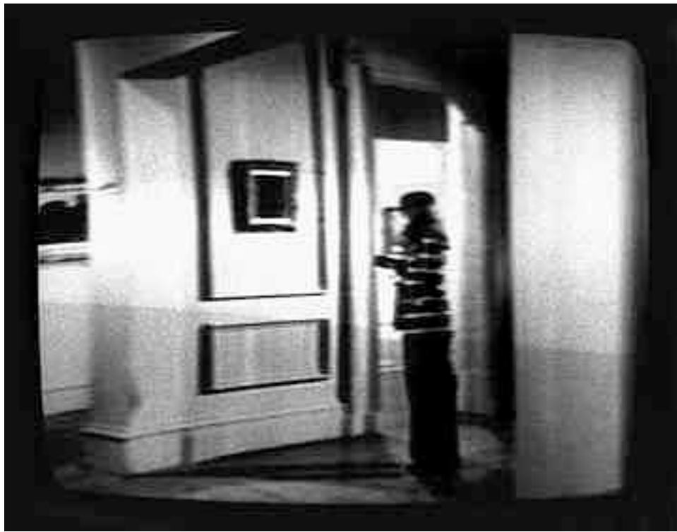
Allan McCollum. Surrogates on Location . 1982. Snapshot from T.V.

the notion of it, but it was no longer painting, no specific, individual painting. A painting that would only stand for a general notion of 'painting' would be no painting. Reduction does not lead to a significant foundation or essence but rather to an emptiness, a nothingness: the absence of anything visible, anything sensually concrete. What remains is the empty convention which governs from the outside, by means of a framework, what institutionally is perceived as a painting. A picture which only stands for painting can, however, be used as a surrogate, a proxy for any other possible picture. It can assume the place of a painting within a framework or an institution; it then functions as a vacant space, an ersatz which keeps the place of a painting vacant and thus allows its absence to be perceived.