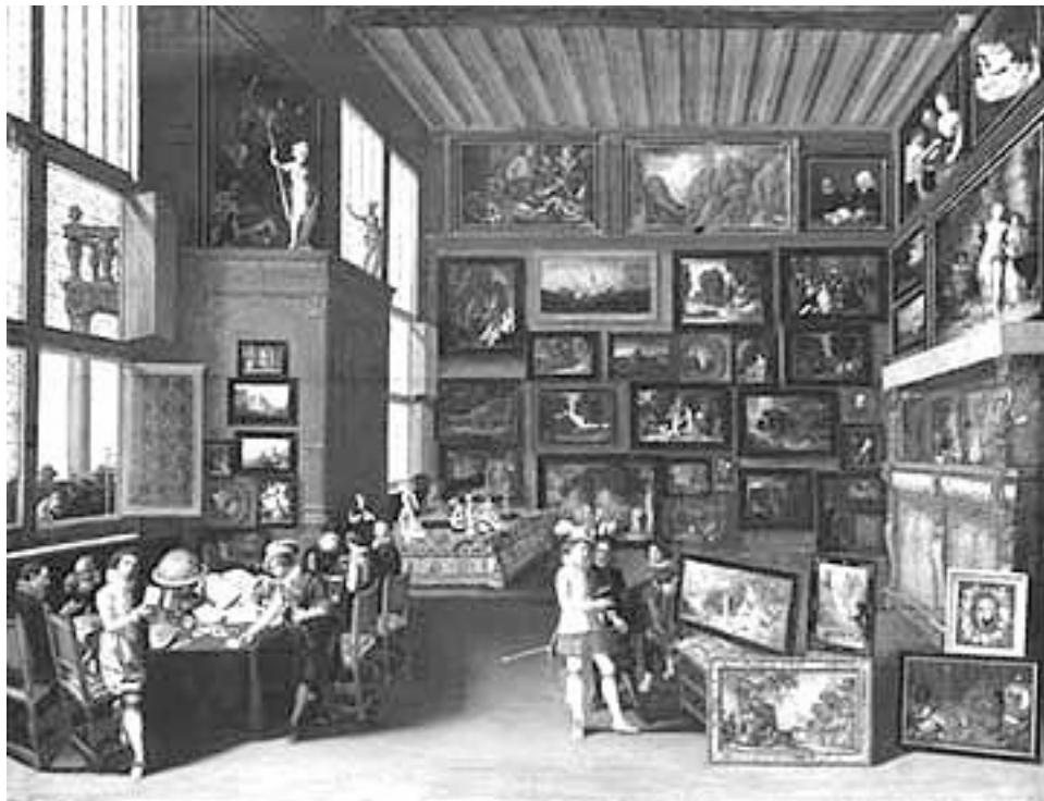
David Teniers, circa 1550.

As opposed to the commodity, the “surrogates” are not just embedded in situations in which their surface, their value is stressed, they also relate to the place and to the context of painting. There they barely fulfill the minimum expectations of painting. They allude to Marcel Duchamp’s subversive strategies at the point where they ostentatiously create a noticeable opposition between the basic fulfillment of the expectations given in a specific situation, governed by the context, the institution, and the disappointment, the lack. This opposition can and should become productive in perception in a critical and analytical sense.