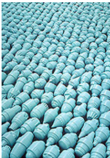
Allan McCollum. Over Ten Thousand Individual Works , (detail) 1987/88.

And so I felt compelled to think about these things and explore these issues to try to produce a kind of artwork that also depicted what I felt industry might not want to express and produce a kind of object that was at the same time a mass-produced thing as well as an art object. To make something that was kind of a reconciliation at a higher level — that was my conceit, not some artwork that was referring to mass production, or vice versa, but something that reconciled both forms of expression into a single form. And I began to think about how many ways industrial production seeks to imitate nature, for instance, in its repetition and in its fecundity.