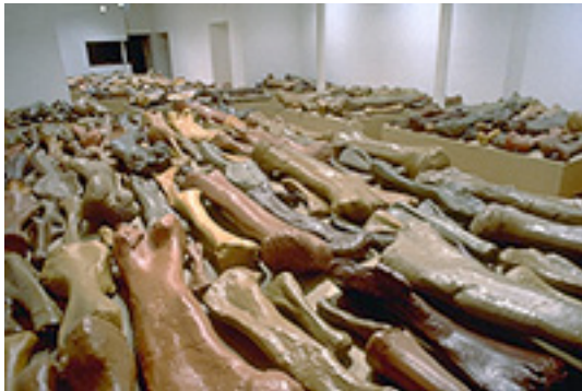
Allan McCollum. Lost Objects , 1991. Enamel on cast glass-fiber-reinforced concrete. Painted replicas made from molds taken from dinosaur bone fossils in the collection of the Carnegie Museum of Natural History, in Pittsburgh, Pennsylvania. Produced in collaboration with the Carnegie Museum of Natural History and the Carnegie Museum of

Tom: Maybe, but there is also the mundane truth that copies are made so that more people can have them at a lower cost than the "original." I think it is too easy to get caught up in the melancholia of reproduction. Life goes on.