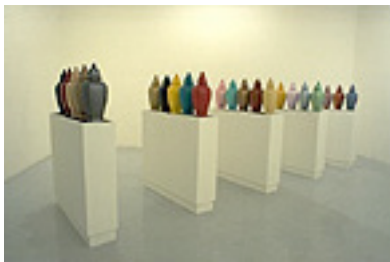
Allan McCollum. Perfect Vehicles , 1985/88. Acrylic paint on solid cast Hydrocal. Installation: Galerie Yvon Lambert, Paris, France, 1989

Allan: Yes, exactly. And that doesn't only happen with heirlooms. I'm forty-eight now, and I have objects I've kept whose significance has been lost to me. I know they meant something to me once — related to some friend or some event — but I honestly don't remember. I'm afraid if I throw them away I'll lose these meanings forever, but, then again, I'll probably never remember what they were anyway. But these objects have an aura of meaningfulness that's unknowable and nonspecific.