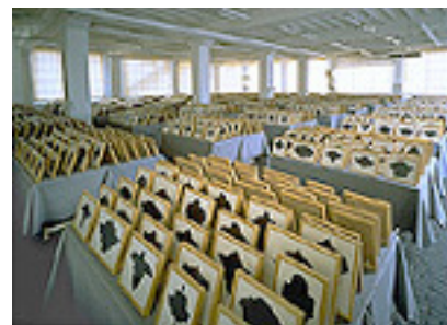
Allan McCollum. Drawings , 1989/93. Graphite on board. Installation: Centre d'Art Contemporain, Geneva, Switzerland, 1993.

I began to wonder if maybe part of that problem is that it's exacerbated by the structure of our symbols, where one object represents many things. Maybe an alternative or additional kind of symbol making could exist where thousands of things were represented by thousands of things. I wondered what that would look like. I was thinking about people when I designed the Individual Works : what people must mean when they talk about the human soul, individual souls, and how you would depict that. With the Drawings I chose this kind of heraldic image that might even suggest a clan or family symbol, but carried that idea through into a