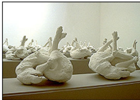
Allan McCollum. The Dog From Pompei , 1991. Cast glass-fiber-reinforced Hydrocal. Replicas made from a mold taken from the famous original “chained dog” plaster cast of a dog smothered in ash from the explosion of Mount Vesuvius, in ancient Pompeii, in 79 A.D. Produced in collaboration with the Museo Vesuviano and the Pompei Tourist Board, Pompei, Italy, and Studio Trisorio, Naples, Italy.

Allan: Exactly. But all representations are about choosing to reduce some thing to a “type,” to some kind of abstraction. In 1978, when I first made notes to myself about what I thought I was doing, I remember inventing terms like, “the standard, occidental wall-mounted artifact.” I know that I wasn’t simply trying to represent only paintings. I remember thinking that I was just performing mimetically like most artists do. This is the way a gallery looks and feels, and I made an imitation of that. There’s not so much difference between doing