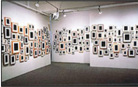
Allan McCollum. Plaster Surrogates , 1982/83. Enamel on Hydrostone. Installation: Marian Goodman Gallery, New York City, 1983.

that and an artist deciding to paint a picture of a landscape. I was influenced by artists like Robert Ryman, Frank Stella, and Daniel Buren: people who seemed to reduce painting down to an extremely simple formula of some kind — some kind of definition of painting.