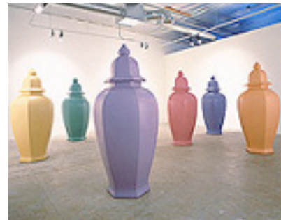
Allan McCollum. Perfect Vehicles , 1988. Acrylic paint on glass fiber reinforced concrete. Installation: Richard Kuhlenschmidt Gallerie, New York, NY, 1988