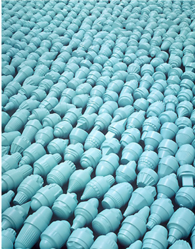
Over Ten Thousand Individual Works , 1987/88. Enamel on cast Hydrocal, each object unique, 2" diameter each, lengths variable. Installation detail. Collection of Louisiana Museum, Denmark.

developed a system for producing thousands of little plaster shapes, about the size of your hand, each one being completely unique. My inspiration was those little objects by Steuben or Fabergé objects with no purpose except to be symbols of value. I thought it would be interesting to operate as an artist who saw no distinction between a plaster souvenir and a Fabergé egg. What kind of object might I design if I didn't recognize that distinction? I was also interested in why we divide up the world of objects into categories of, say, the mass produced