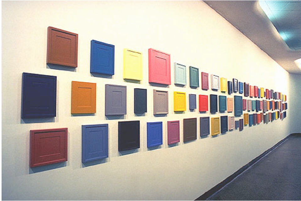
Allan McCollum. Surrogate Paintings , 1978-79. Acrylics and enamels on wood and museum board. Installation: 112 Workshop, New York City, 1979.

In a show in 1979, I put eighty of these “Surrogate Paintings” together in a cluster. It was hard to deny that there was something a little off about these works: they weren’t exactly paintings, they were objects that represented paintings. I decided that maybe if I started giving them a black center, and articulating the frame with a slightly different color, I might make it more explicit that they weren’t little Minimalist sculptures but signs representing paintings. One problem I had during this period was getting people to recognize that the frame and mat were parts of the work. It was almost impossible for people to understand that; they would point to the center and say, “Oh, this is the work here.” At first I tried to counteract that by making the whole object monochrome, but in the end I had to come