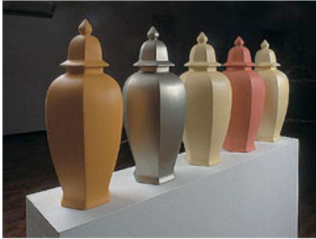
Allan McCollum. Perfect Vehicles . 1985. Acrylic paints on cast Hydrocal. 19 x 9 x 8 1/2 inches each.

up with a technical solution: I took twenty of the “Surrogate Paintings,” made molds from them, and began to cast them in plaster. Once I started doing that, I was able to make a lot more of them in less time—it had taken days to make them out of wood. So I was able to produce larger, more dramatic installations, and also to solve the question