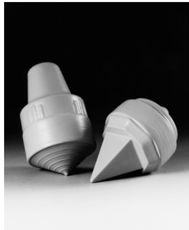
Allan McCollum. Over Ten Thousand Individual Works (detail). 1987-88. Enamel on cast Hydrocal, 2” diameter each, lengths variable.

In 1987 I began a series called “Individual Works,” which addressed the notion of the unique versus the mass produced object probably more than any other series did. I