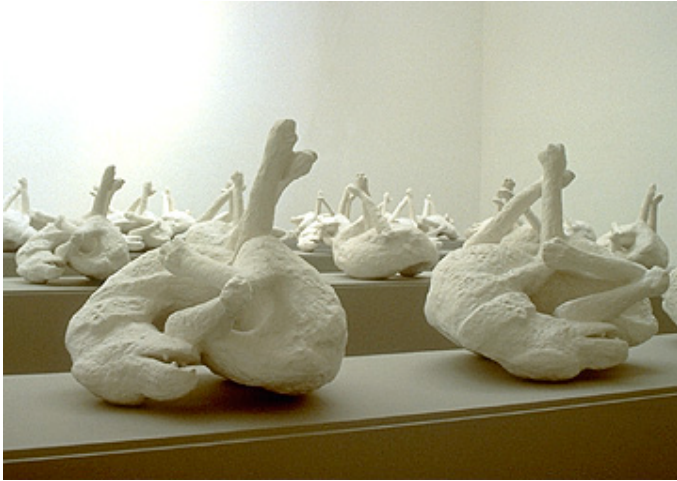
Allan McCollum. The Dog From Pompei , 1991. Cast glass-fiber-reinforced Hydrocal. Replicas made from a mold taken from the famous original "chained dog" plaster cast of a dog smothered in ash from the explosion of Mount Vesuvius, in ancient Pompeii, in 79 A.D. Produced in collaboration with the Museo Vesuviano and the Pompei Tourist Board, Pompei, Italy, and Studio Trisorio, Naples, Italy.

these objects become even more magical once they are put into a museum collection, they automatically seem that way, and that's a part of what I'm exploring in this fulgurite project.