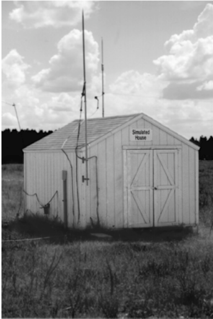
The lightning research center's Simulated House, the 'Sim House,' used as a target for triggered lightning research.

JD: How did your experiment differ from the other ongoing research projects?