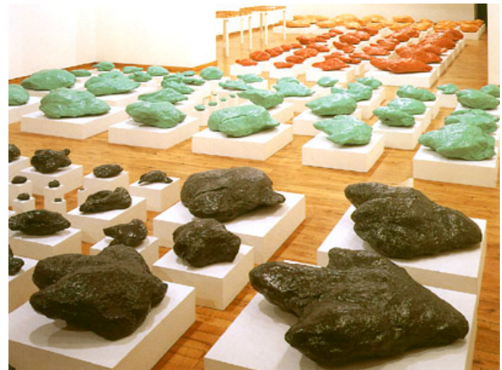
Allan McCollum. Natural Copies from the Coal Mines of Central Utah , 30" x 30" x 30" each, 1994-95. Enamel paint on cast polymer-enhanced Hydrocal. Natural dinosaur track cast replicas produced in collaboration with the College of Eastern Utah Prehistoric Museum, Price, Carbon

– and put them in my own museum exhibits and gallery exhibits. I tried a little to get the museum interested in this, but they didn't seem to be so fascinated with the idea. But they very generously let me hire one of their preparators to make the molds for me, in their own paleo lab. In the winter very few people come to the museum, and they sometimes need to lay people off, which they don't like to do, so I paid them to keep their two preparators working for three extra months or so. That was really their main reason for letting me do it, I suspect. We both helped each other. I think they also really loved the idea that somebody was interested in these things and that might have been a little guilt on their part because they weren't really so interested in them, scientifically.