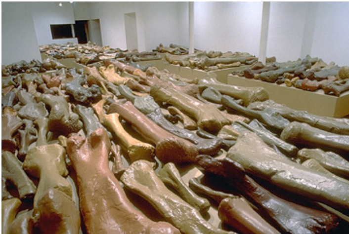
Allan McCollum. Lost Objects , 1991. Enamel on glass-fiber-reinforced concrete. Cast dinosaur bones produced in collaboration with the Carnegie Museum of Natural History, Pittsburgh, Pennsylvania.

AM: Yes. The bones were from Utah, and from Colorado and Wyoming too. It was while I was working