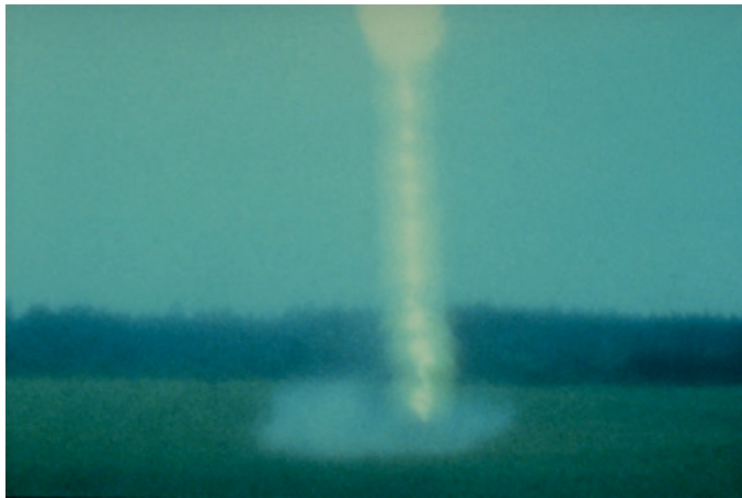
Actual lightning strike that created the fulgurite, triggered by the artist and the crew at Camp Blanding. The research center is not only involved in academic research, it also studies how lightning affects underground pipes, power lines, electrical equipment, golf course shelters, airport runway lights, and other systems.

AM: That's a loaded question! (Laughter)