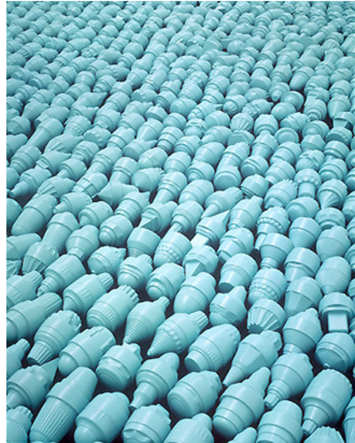
Allan McCollum. Over Ten Thousand Individual Works [detail], 1987/88. Enamel on cast Hydrocal. 2" diameter, lengths variable, each unique.

This kind of wishing became the background of my work. In addition to the idea of a ‘painting’ or a ‘sculpture,’ I started following through with other collectibles that weren’t art but seemed to follow the same rules. I started collecting rocks and concretions and fossils and things from nature. And because I am interested in the principles of copying, and how the concept of something being copied conditions the way we perceive its value or meaning, I was drawn to fossils and objects that were essentially copies in the first place. I became drawn to objects that were copies at their very origin – natural casts, natural molds, petrified