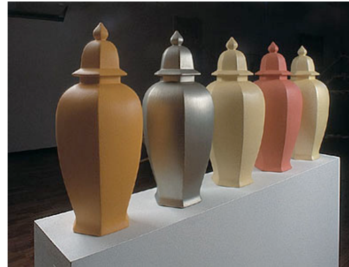
Allan McCollum. Five Perfect Vehicles , 1985. Acrylic on cast Hydrocal. 19 " x 9" x 8 1/2" each.

During a part of this time I was working at a museum of architecture and design, the Cooper Hewitt Museum in New York, in the registrar's department. There I came to understand very quickly and clearly that some objects were often separated from one another simply because they belonged either to wealthy people or to poor people, and the objects that were owned by wealthy people were sometimes specifically produced for wealthy people by their loyal artisans – and the more money the collector could afford, the more exotic the materials and the more expensive the object would become! (Laughter) And of course they were usually the one-of-a-kind types of concoction. I mean, who's to say what value the governor's wife's wedding dress would have if the governor's wife hadn't owned it? Is this truly a design criterion? So I started recognizing that all the arts sort of worked this same