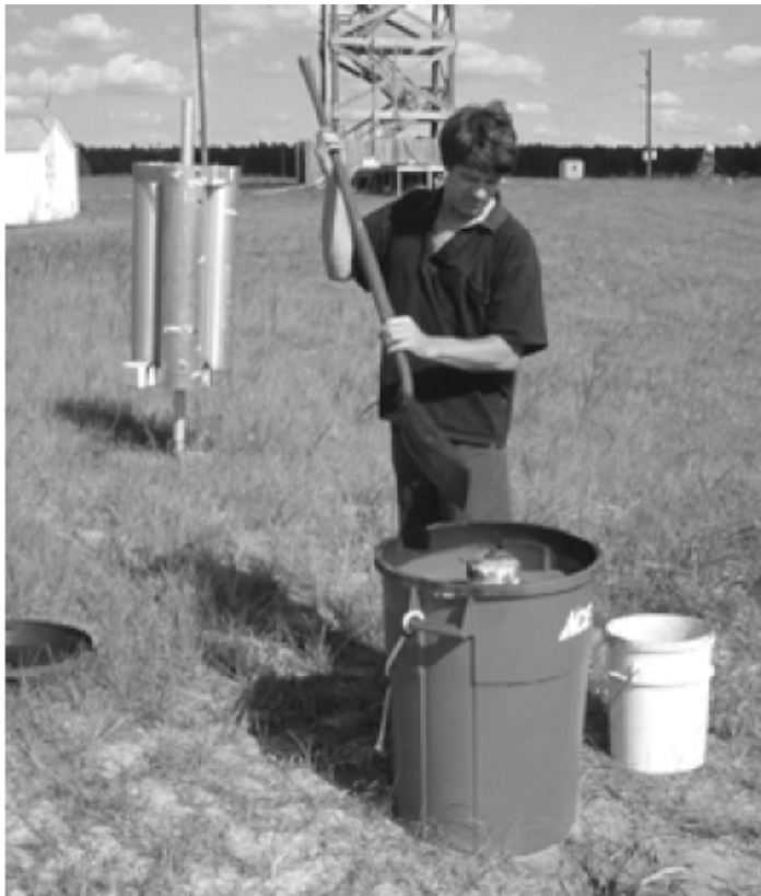
The rocket and the sand-filled receptacle used in McCollum's lightning-triggering experiment to create the fulgurite.