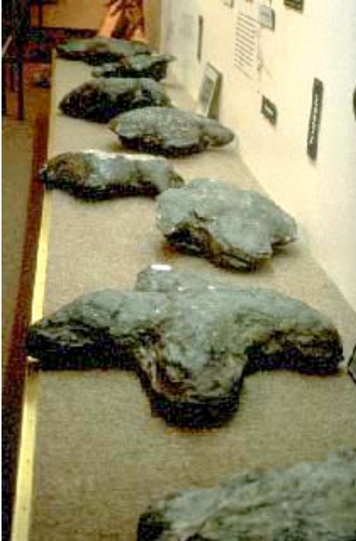
Natural casts of dinosaur footprints, chiseled down from the roofs of Utah coal mines. Collection of the College of Eastern Utah Prehistoric Museum, City of Price, Carbon County, Utah.

– and put them in my own museum exhibits and gallery exhibits. I tried a little to get the museum interested in this, but they didn't seem to be so fascinated with the idea. But they very generously let me hire one of their preparators to make the molds for me, in their own paleo lab. In the winter very few people come to the museum, and they sometimes need to lay people off, which they don't like to do, so I paid them to keep their two preparators working for three extra months or so. That was really their main reason for letting me do it, I suspect. We both helped each other. I think they also really loved the idea that somebody was interested in these things and that might have been a little guilt on their part because they weren't really so interested in them, scientifically.